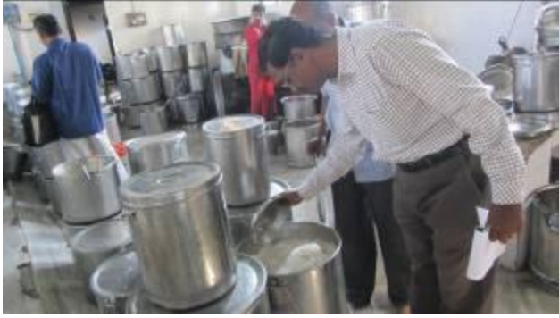
Cooked Rice is inspected by the Monitoring team