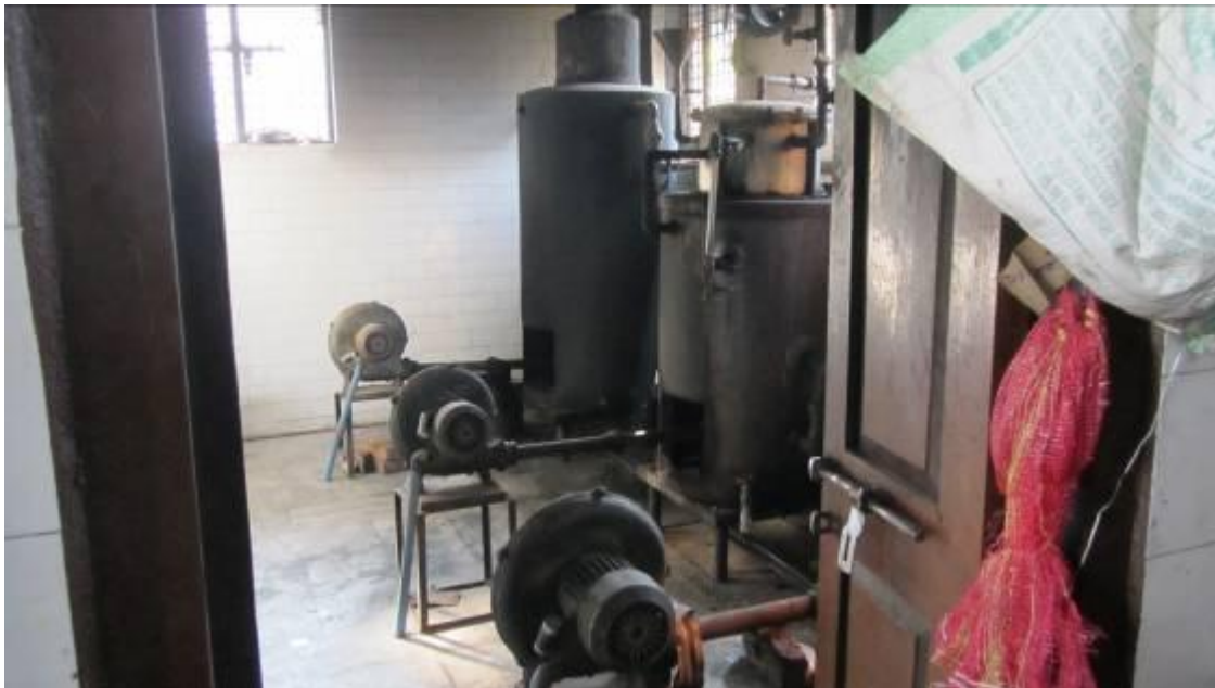
Diesel based cooking stove to generate steam for cooking

For boiling of milk kerosene stove as fuel to serve hot milk to the students in morning and evening.