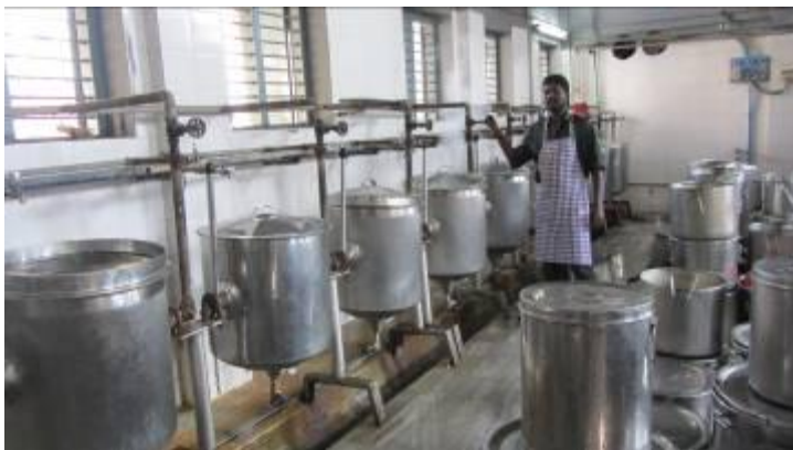
Modern Central Kitchen with steam cooker