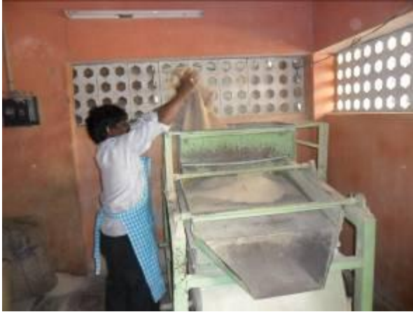
Rice are weeded before boiling