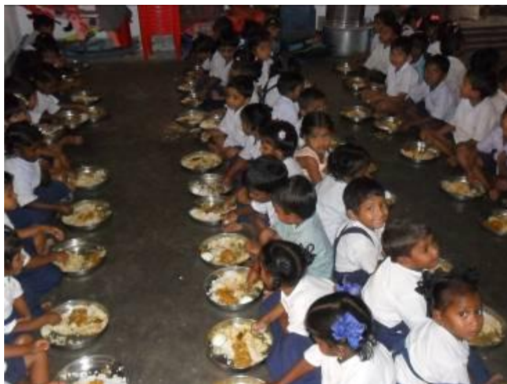
The students are made to sit in a row to dine their food

the place is washed and cleaned by the sanitary assistant.