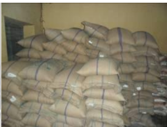
Rice supplied by FCI

(iii) Is the quantity of food grain supplied was as per the marked/indicated weight?