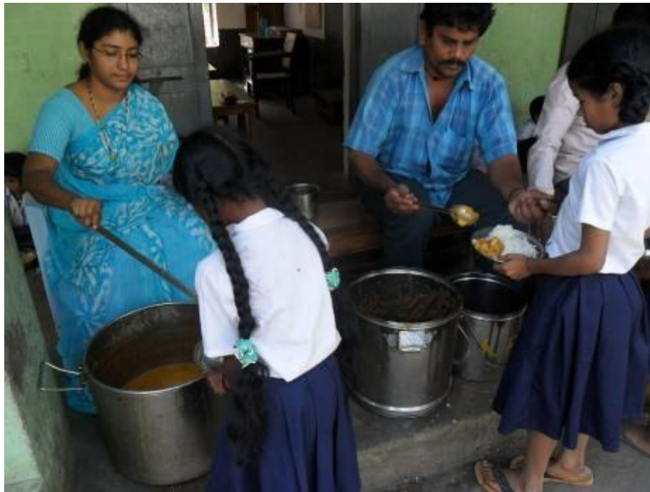
The teacher servers the food for the students

The teachers will be assigned to monitor the students on rotation basis.