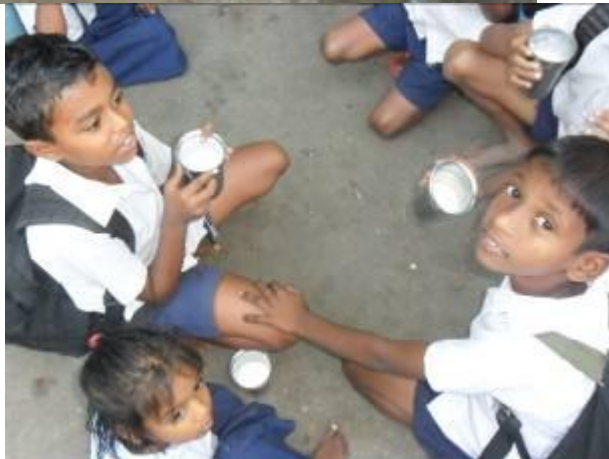
Student's drinking hot milk

State government sponsored programmed in the name of Shri Rajiv Gandhi breakfast & Evening Milk Scheme