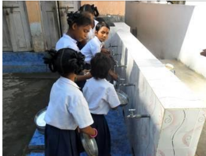
The students wash their hands and plates before dining

MDM is served in the verandah of the schools. The students were made to stand in rows and the teacher will be monitoring to wash their plates, hand and dine without wasting the food.