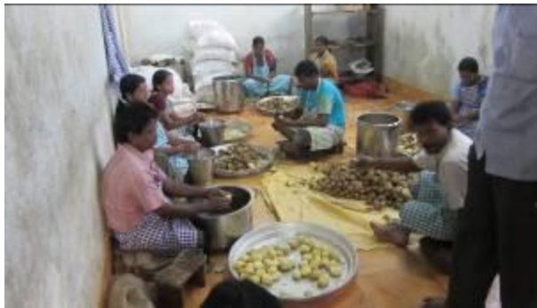
The food in the central kitchen were engaged in cooked in the steamer cooking oven