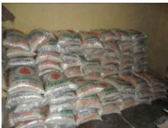
Rice supplied by pvt. Agency

Rice and groceries are Buffer stock for one-month's requirement. The vegetables and egg are supplied weekly and the stock register is maintained properly by the sparring services of teaching staff (TGT) who is in-charge for the single central kitchen of Yanam District.