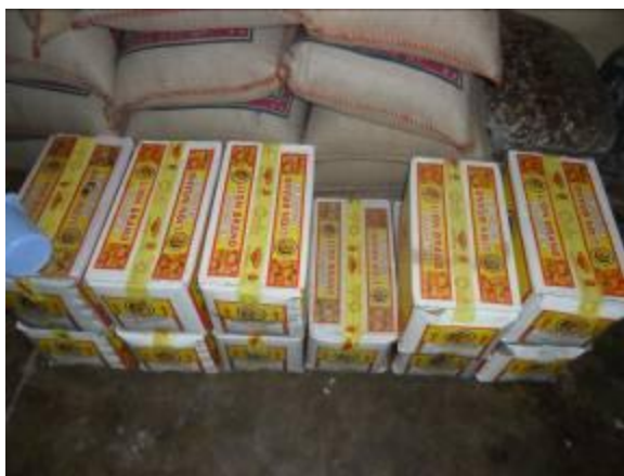
Branded Cooking oil

Yes, The quality of food grains supplied was found good. The groceries purchased are of standard quality mostly branded products