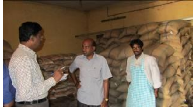
The store room were well organized