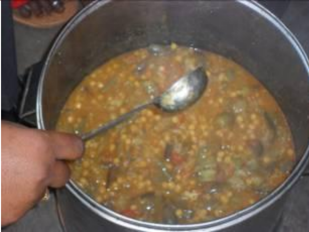
Food served with egg twice a week curry