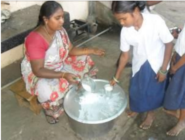
Boiled milk served to the students