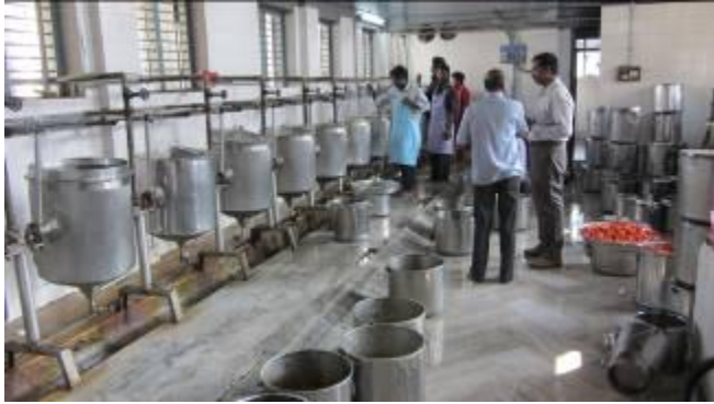
Neat and clean cooking environment