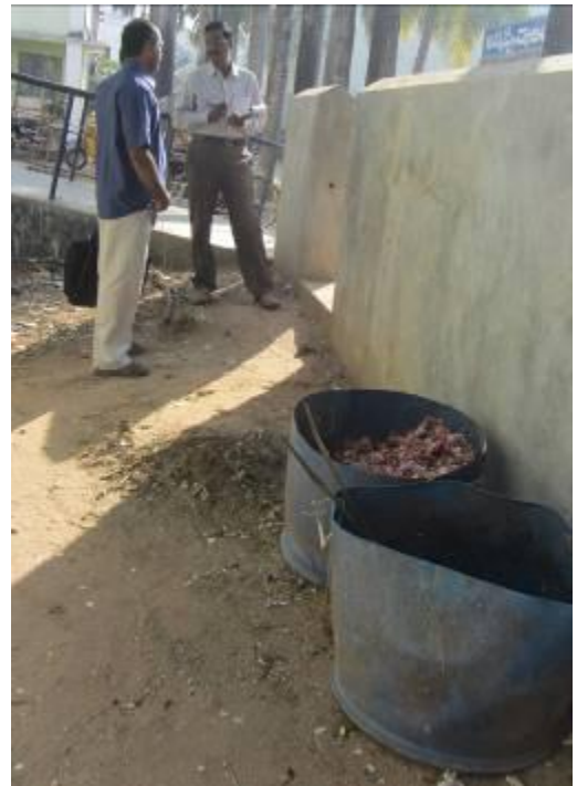
Collected Garbage placed behind the compound wall of the Central Kitchen