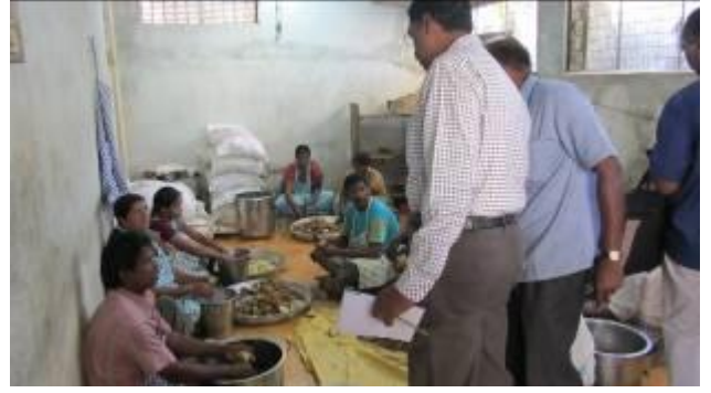
Vegetable cleaning process by cooking helpers