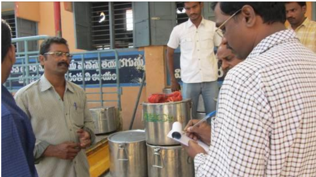
The food carrier are loaded in the van for distribution in the school the van driver was enquired regarding their duty

The cooked food is delivered from the Central Kitchen were moved by three contract van to the schools at three different route. For each van Rs.450/- per day was paid and each van is accompanied by a meal carrier staff who was paid Rs.150/- per day. The responsibility of them is to supply the meal carrier and should collect the empty carrier and to be deposited in the central kitchen. This transportation contract was entrusted to the Yanam co-operative society.